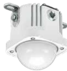
Cube-Light Compact LED Area Light

Wattage 9W Lumens up to 1100 Warranty 5 years