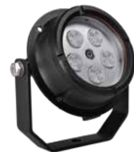
ARIES 16W LED Floodlight

Wattage 37W Lumens 2900 Warranty 5 years