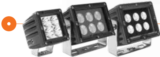
DC Blasthole Drill