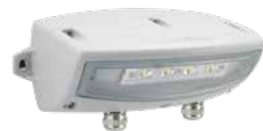
Wayfinder™ LED Accessway Light