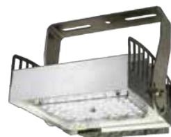
Command Flood® Series Marine Grade Floodlight

Wattage up to 121W, 231W (pictured) or 438W Lumens up to 15000, 30000 or 52500 Warranty 5 years