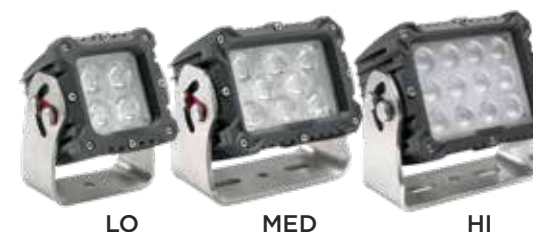
Sturdilite® Master Series Low-voltage LED Floodlight

Wattage 18W Lumens up to 2500 Warranty 5 years