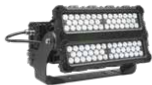
ModCom® 3 Series Hazardous Rated LED Floodlight