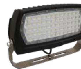
Midline™ Flood 2 Marine Industrial LED Floodlight

Wattage up to 24W, 48W or 82W Lumens up to 2500, 5000 or 7600 Warranty 3 years