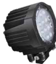
SturdiLED® Super-rough Service LED Floodlight