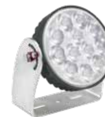
Sturdilite® Grind 18W LED Floodlight

Wattage 37W Lumens up to 2900 (5300K), up to 2150 (RED LEDs) Warranty 5 years