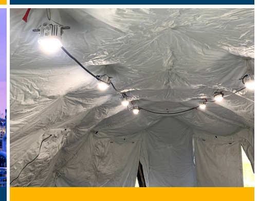
Low Bay and Tent Lighting