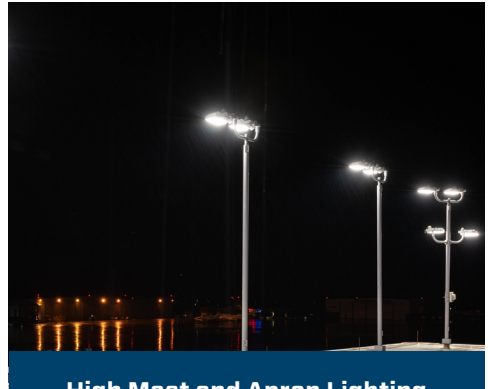
High Mast and Apron Lighting