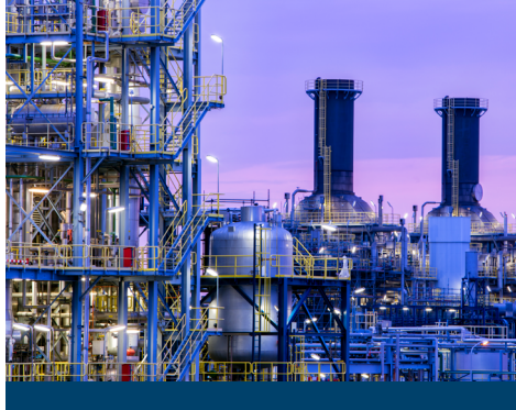
Hazardous Location Lighting