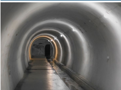
Munitions Bunker and Underground Lighting