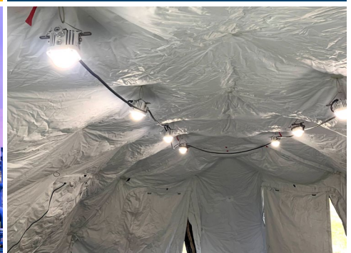
Low Bay and Tent Lighting