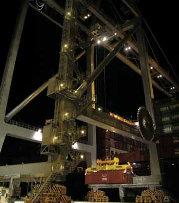
Prismalence is not convinced that LEDs are the way forward, other than for pinpoint illumination of an area at the foot of a crane