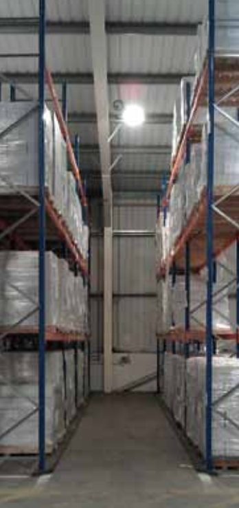
Illumination difference: on the left, an aisle lit by a 400W HPS lamp; on the right lit by a GlowLED 160W LED lamp

relate to the lighting profile that controls the system. In warehouses, where often banks of lights are used in separate bays, it is possible to light only the area in which people are working with a single light unit, rather than wasting energy by using the entire bank of lights in that aisle," said Tahmosybayat.